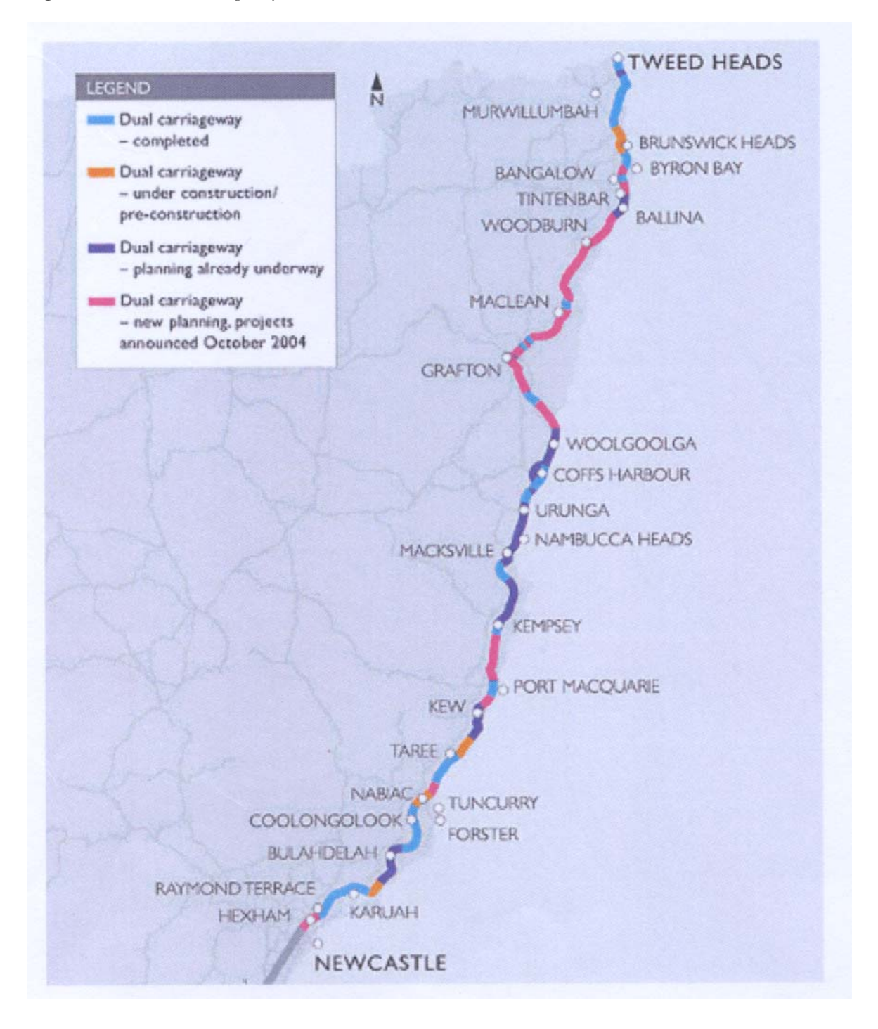
Figure 1 Pacific Highway – Tweed Heads to Newcastle

Note: All maps are sourced from the RTA website <a href="www.rta.gov.au/">www.rta.gov.au/</a>.